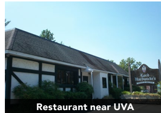
Restaurant near UVA