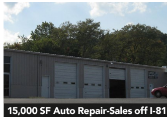
15,000 SF Auto Repair-Sales off I-81