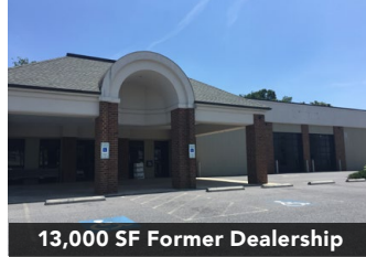
13,000 SF Former Dealership