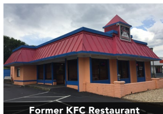
Former KFC Restaurant