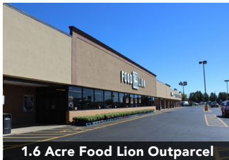
1.6 Acre Food Lion Outparcel