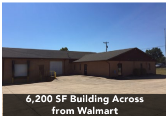
6,200 SF Building Across from Walmart