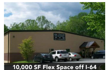
10,000 SF Flex Space off I-64