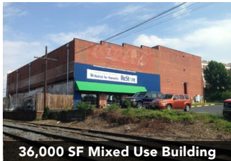
36,000 SF Mixed Use Building