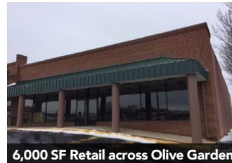
6,000 SF Retail across Olive Garden