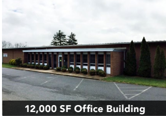
12,000 SF Office Building

Always a Great Selection of Commercial Properties For Sale or Lease Sample of Recent Sold/Leased Properties