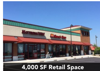
4,000 SF Retail Space