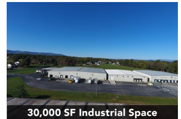
30,000 SF Industrial Space