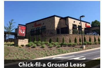
Chick-fil-a Ground Lease