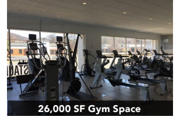
26,000 SF Gym Space