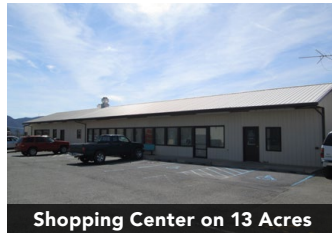
Shopping Center on 13 Acres