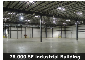
78,000 SF Industrial Building