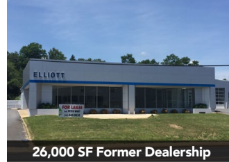
26,000 SF Former Dealership