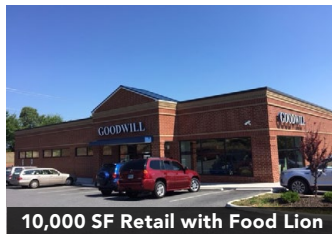
10,000 SF Retail with Food Lion