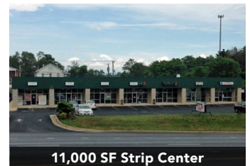
11,000 SF Strip Center