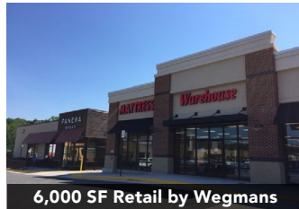
6,000 SF Retail by Wegmans