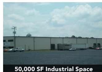
50,000 SF Industrial Space