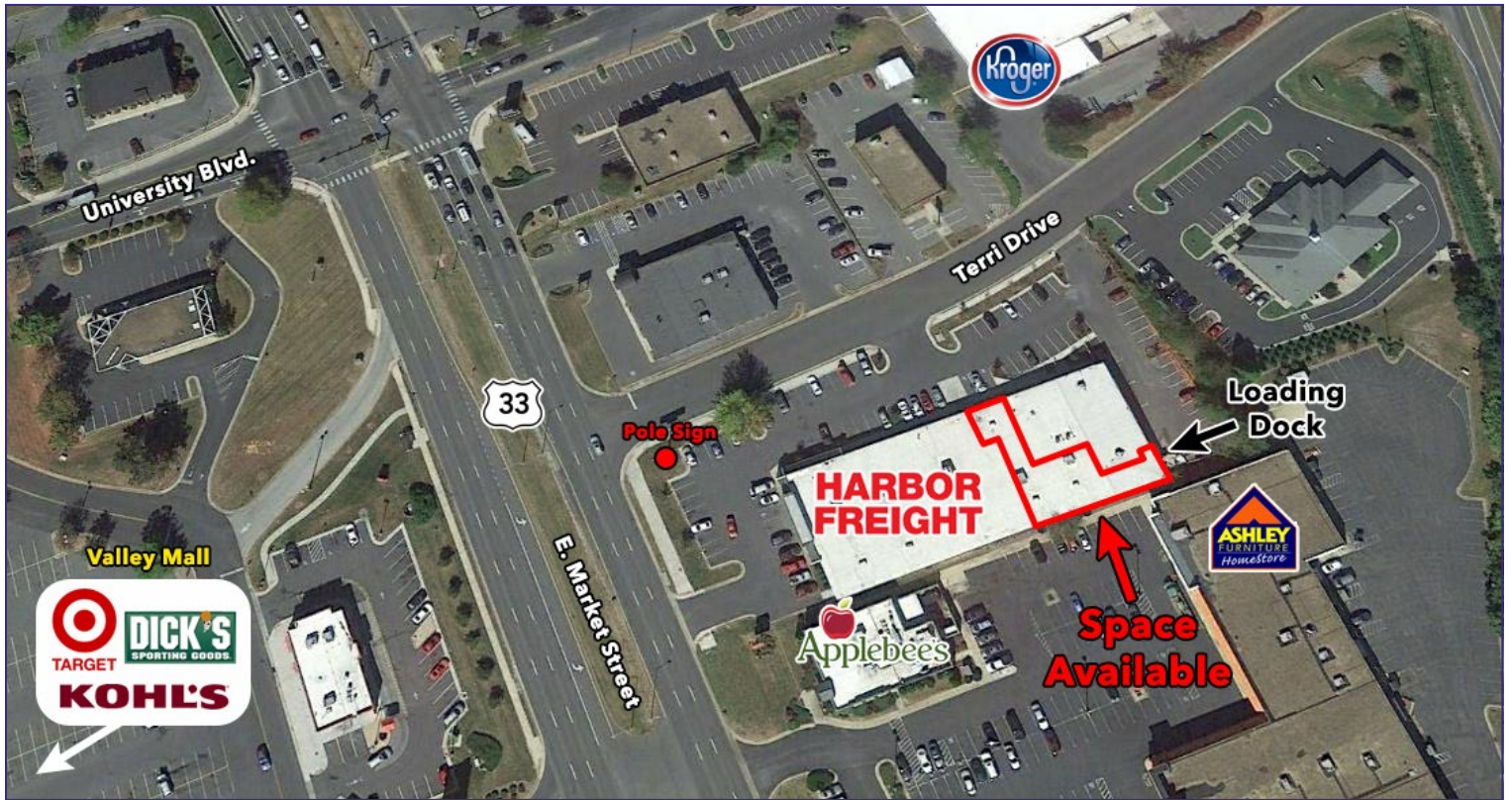
Existing Condition 1854 East Market Street